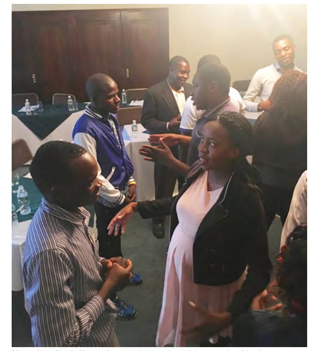
Margolis wheel discussion on interactions between health departments and youth, Harare

Page 6: Luchtsingel / ZUS + Hofbogen BV, Ossip van Duivebode Page 7: Ruzivo website, accessed 2018 Page 8: R Loewenson, 2018